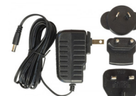
Universal Power Adapter