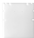
Necklace & Earring Stand